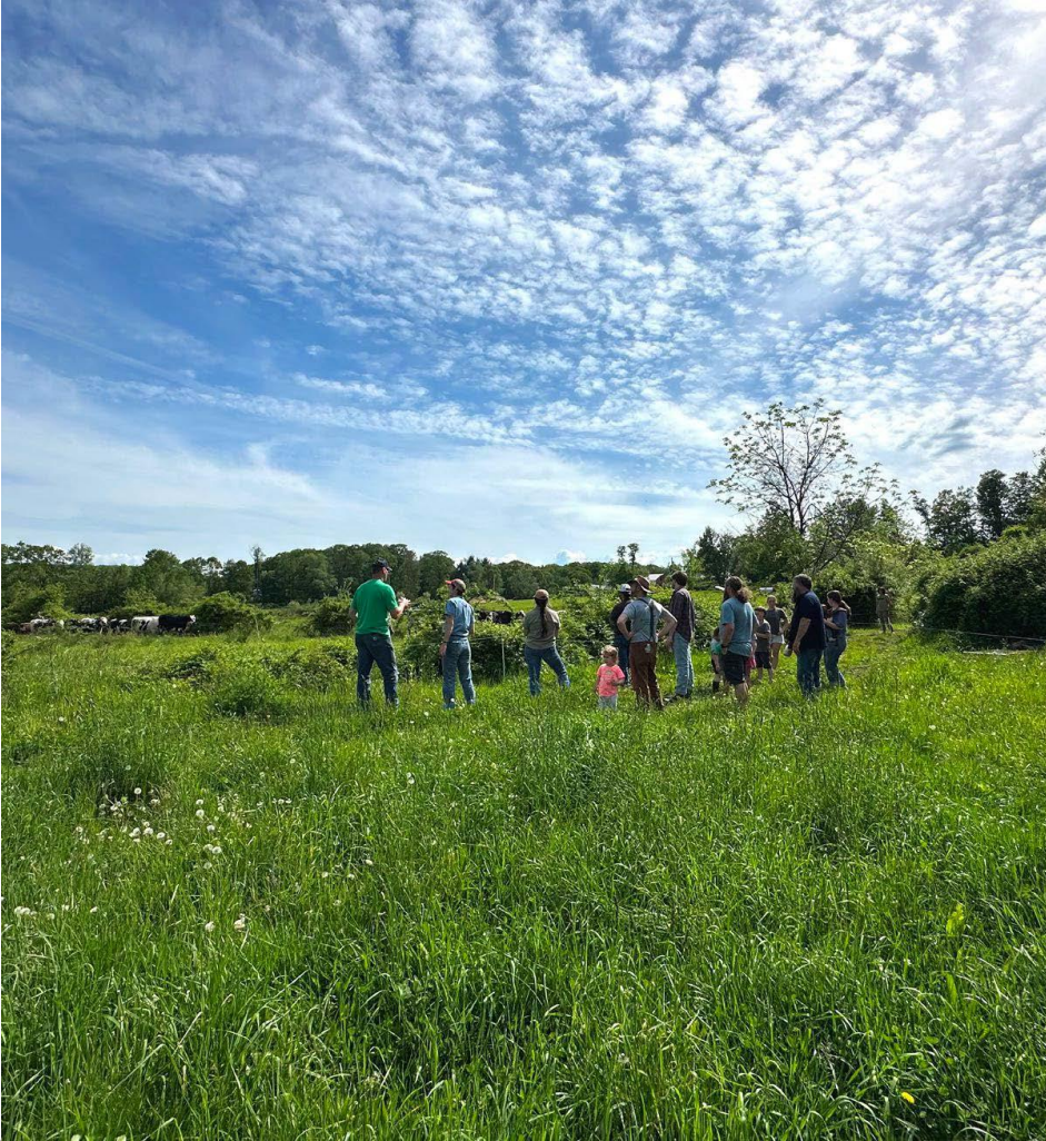
Chase Hill Farm in Warwick, MA