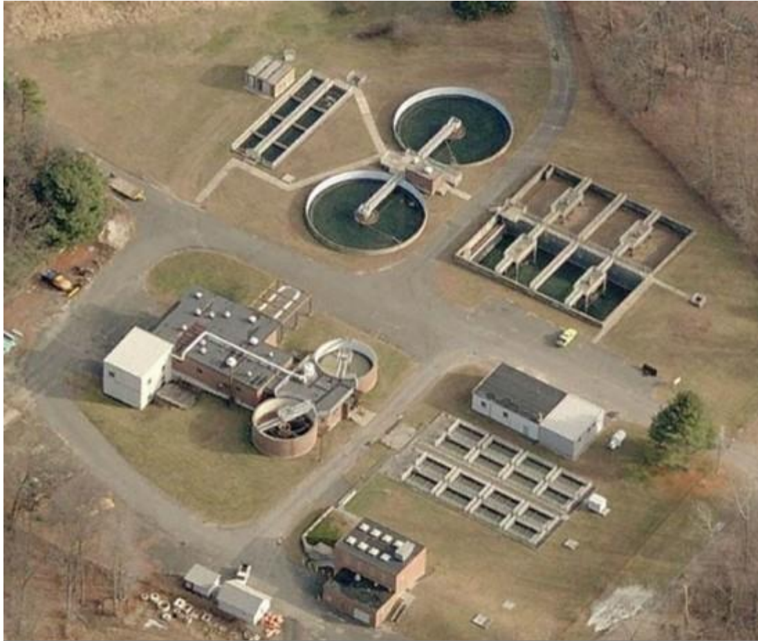
City of East Hampton Wastewater treatment on the Connecticut River

City of Pittsfield, MA: Stormwater and Green Infrastructure Improvements at DPW yard and school. Grant: $637k