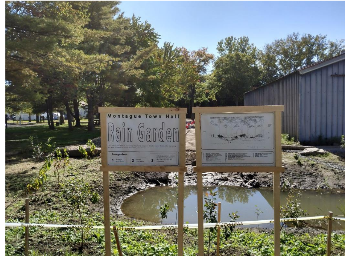
Town of Montague Rain Garden