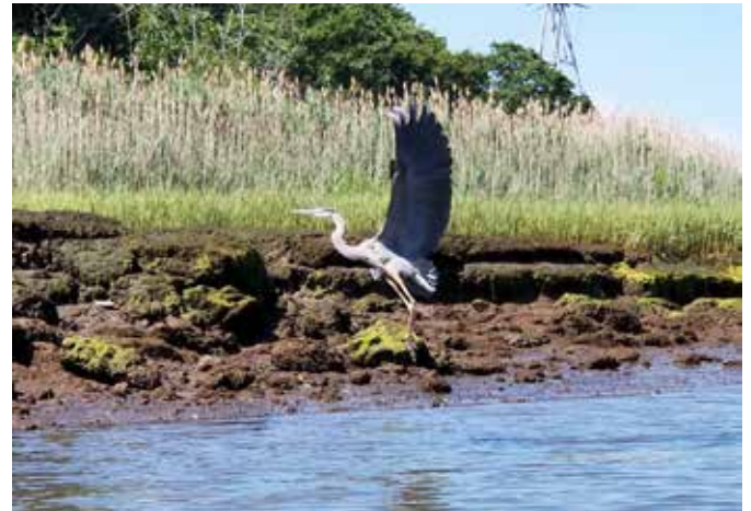
Fore River

Despite a difficult year, the state budget for fiscal year 2021 ended up with significant increases for state environmental agencies! Mass Rivers appreciates the support from our legislators who approved these increases, which all go toward better stewarding our precious natural resources. Here's a breakdown: