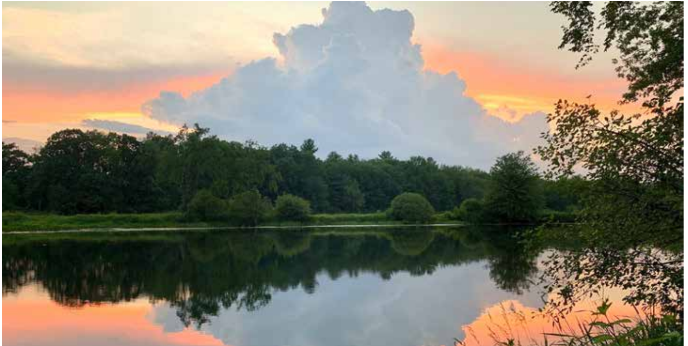
Nashua River, Photo by Stacy Chilcoat