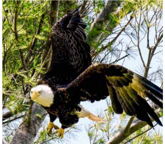
Male bald eagle, Charles River

We are delighted to begin this program hitting the ground running! Our initial focus has been on assisting our member groups who wish to protect and restore streamflows through the state's Water Management Act (WMA). The WMA was enacted in the mid-1980s to regulate large surface water and groundwater withdrawals (100,000 gallons per day or more) in the Commonwealth. Permittees are primarily municipalities, golf courses, and other large water users. The regulations were revised in 2014 to include stronger protections for the environment, and require some permitted water users to reduce the impacts of their withdrawals on streamflow and aquatic habitat.