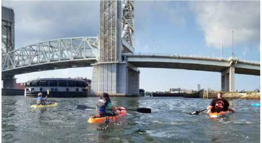
Fore River